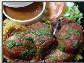
Chuletas fritas Fried pork chops