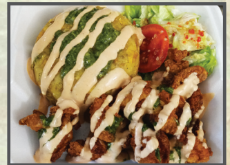
Chicharron de pollo Boneless crispy chicken