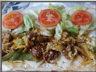
Sandwich de chorizo Choripan sub