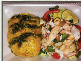
Ensalada mixta de marisco Mixed seafood salad