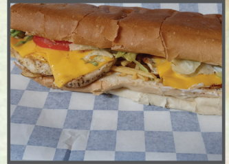
Sandwich de pollo Chicken sub