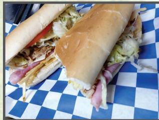
Sandwich Cubano Cuban sub