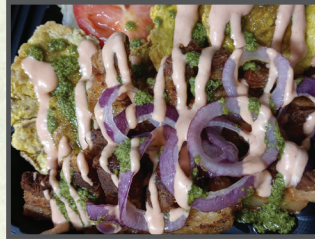
Chicharron de cerdo Concrek pork skin