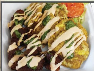
Carne frita Fried pork meat