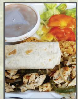
Fajitas de pollo Chicken fajitas