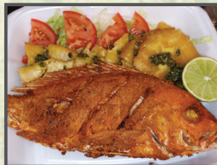
Chillo frito Fried red snapper