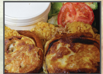
Piononos Meat roll of sweet plantaing