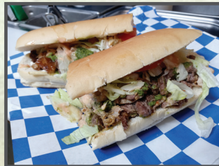
Tripleta Triple meat sub