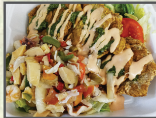
Ensalada de carrucho Conch meat salad