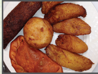
Appetizer – Alcapurri, potato ball, beef empanadas and sweet plantaing