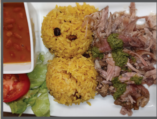
Lunch – Pernil azado Pulled pork